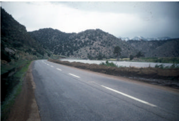
Berm along Highway 50 just East of Cotopaxi.