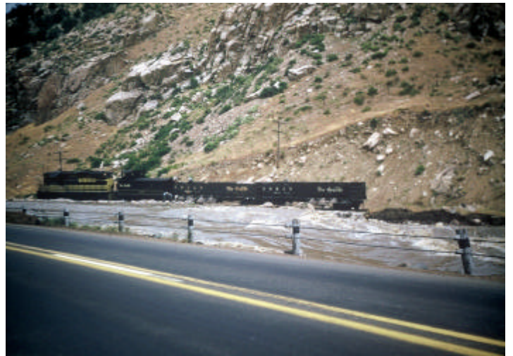
RR crew working on berm.