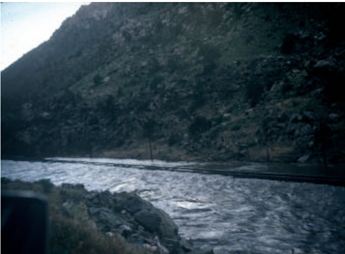
Flooded RR tracks near Cottonwood Curve.

get, to shore up the road along Flood Creek, under Highway 50, and then we shored up the bridge abutments. We had some rocks as big as 4 to 5 feet, but when we dumped them in the river, they disappeared! We finally got enough rock and dirt to prevent the road or the bridge from washing out. The river was so high, it started coming up onto Highway 50 at Cottonwood corner, near where Cottonwood Creek Road comes out onto Highway 50. So people made a berm along the road there, to keep it off the highway. It was really a mess!